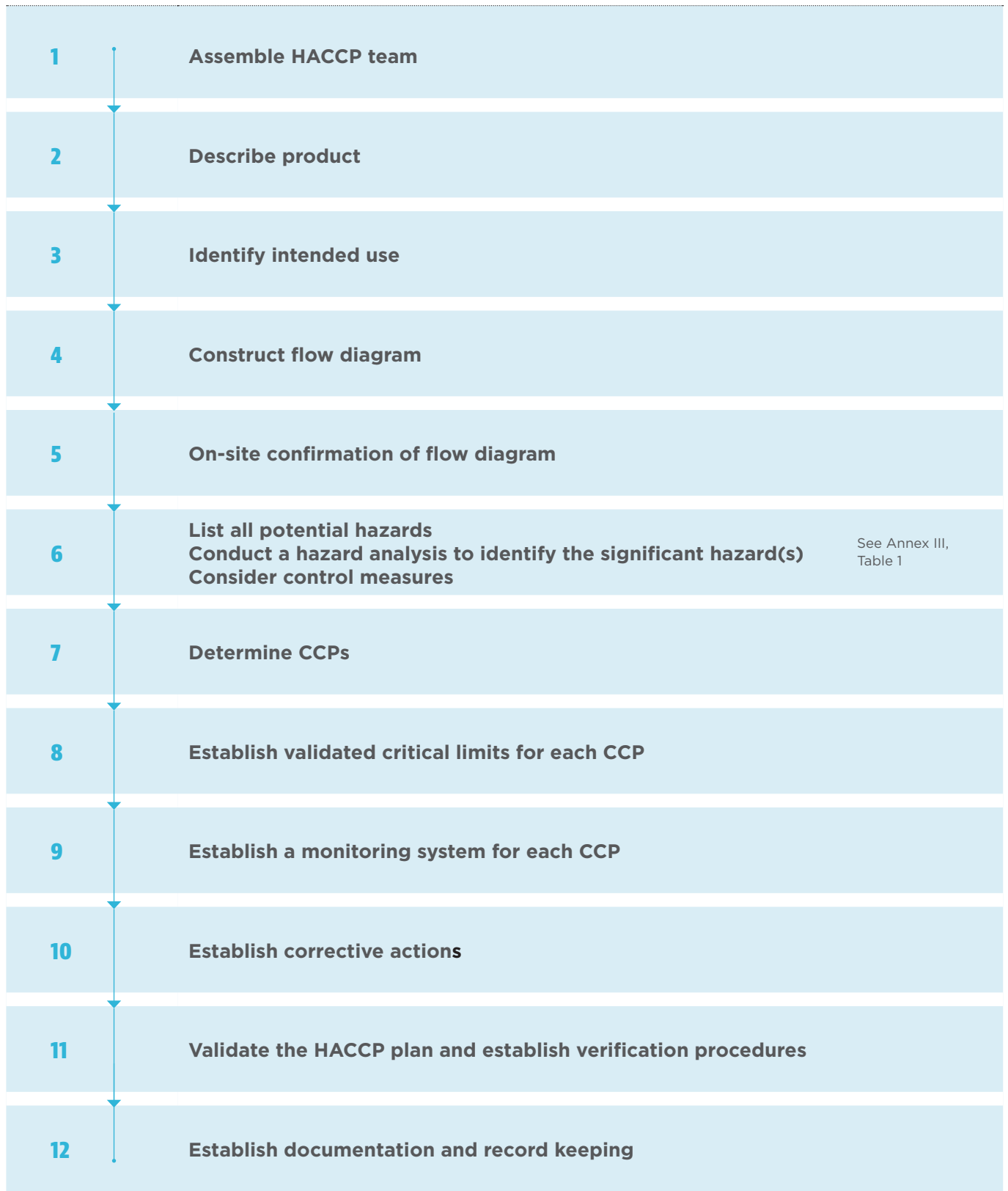
Figure 1 Logic sequence for application of HACCP